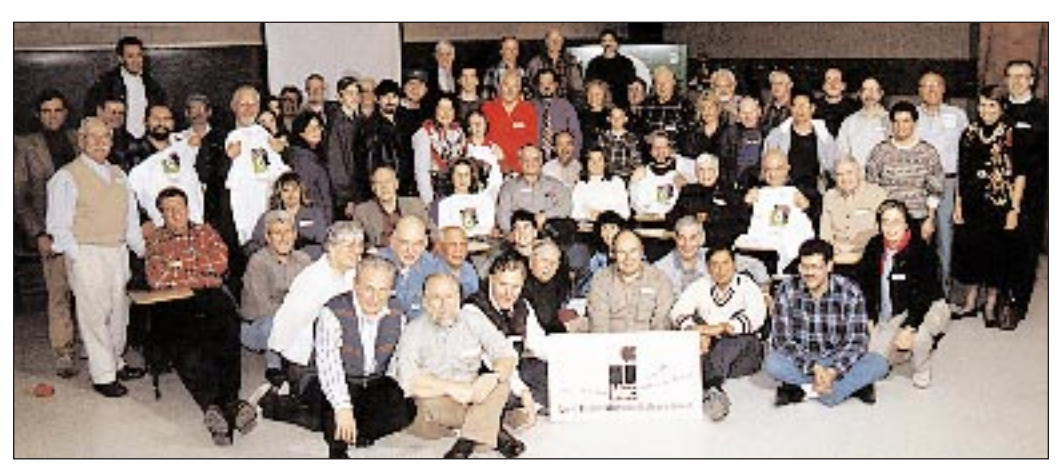
All those that were in attendance. Doesn't everyone look happy?