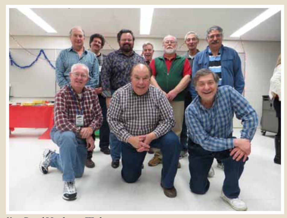
Your Board Members at Work

cable to carry the video, such as this 10′ one: <a href="http://www.monoprice.com/Product?c">http://www.monoprice.com/Product?c</a> id=1025°cp id=10231°cs id=1023104°cp id=2405°cseq=1°cformat=2</a> and then a ½°s stereo plug to dual RCA cables for the audio, like this one: <a href="http://www.monoprice.com/Product?c">http://www.monoprice.com/Product?c</a> id=1025°cp id=102185°cs id=1021817°cp id=9769°cseq=1°cformat=2. The audio connection may be paired with a DVI connection, not HDMI which typically will already have audio, so you would need a DVI-DVI cable, such as this: <a href="http://www.monoprice.com/Product?c">http://www.monoprice.com/Product?c</a> id=1025°cp id=1020902°cp id=2759°cseq=1°cformat=2