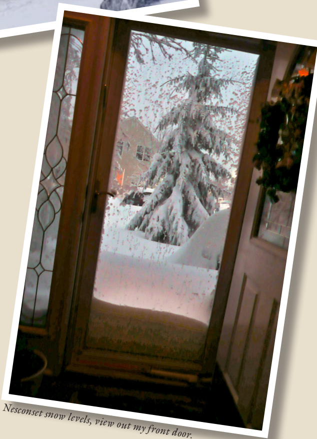
Nesconset snow levels, view out my front door.