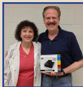
Last Month's Grand Prize Winners

The problem may be on the Time Capsule drive where the drive may be mostly full and Time Machine is trying to delete old files to make room for newer ones. The problem may be on the internal drive. I would suggest using the free TM Error Logger to better locate the problem folder. It helps interpret the system.log file. Time Machine contributes to as the backupd Core Service. I also have found BackupLoupe useful. It could be a coincidence and your Time Capsule has over heated and failed. Many of them have. See http://tidbits.com/article/11091