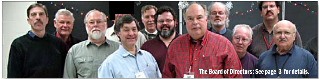
The Board of Directors: See page 3 for details.

Try PTHPasteboard, for its clarity, its power, and its wonderful "set it and forget it" ease of use, not to mention its (lack of) price. PTHPasteboard 4.0 is a universal binary, and requires Mac OS X 10.4 Tiger. It's free; the Pro version costs $20 with a free 30-day trial period. ( http://download.pth.com/PTHPasteboard/PTHPasteboard.prefPane.dmg ).