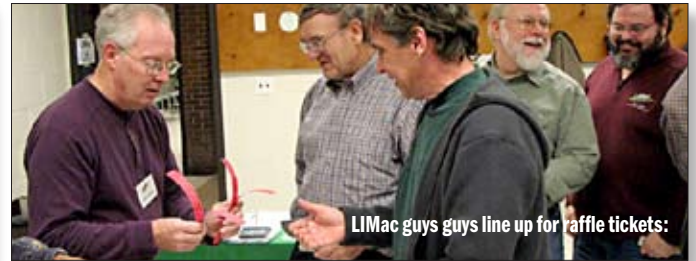
LIMac guys line up for raffle tickets: