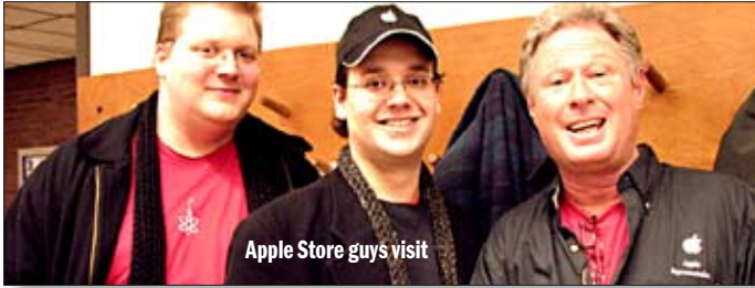
Apple Store guys visit