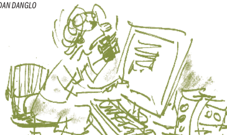
THAT'S IT CHARLIE...YOU'RE OFF MY BOOKMARKS!