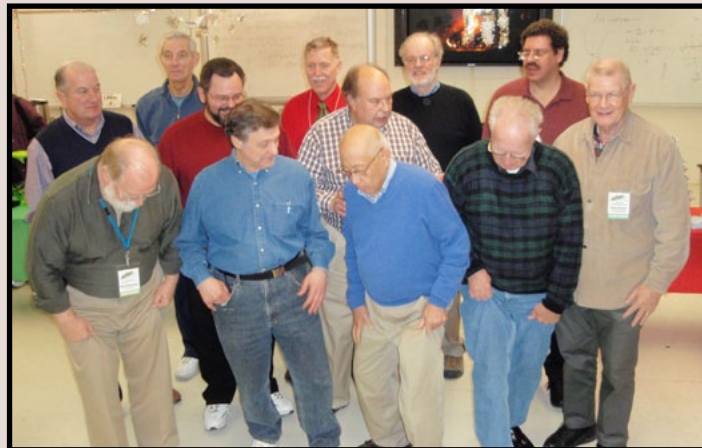
Board of Directors doing the two-step at our 2010 Holiday Party.

Macworld offers MUG members a special subscription offer. Macworld magazine is the ultimate Mac resource! Each issue is packed with industry news, future trends, practical how-tos, in-depth features, tips and tricks, and more; Macworld provides the tools Mac professionals and enthusiasts need. Best of all, you can depend on their unbiased, thorough product reviews and buying advice. Stay informed about what's new, exciting, important. Become a Macworld reader. Normal Price: $27.97 UG Price: $15.00 for 12 issues. [REDACTED]