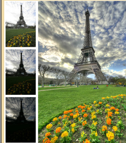
HDR image (created from the 3 left photos) + Tone Mapping

HDR imaging . . . it's all the rage these days. What's HDR you say? It stands for "High Dynamic Range," which is actually a technique that overcomes a limitation of digital cameras; that is, the ability to capture the full range of light and dark areas in a scene. HDR does this by combining multiple images of the same subject, each with a different exposure. The series of images, usually three or five